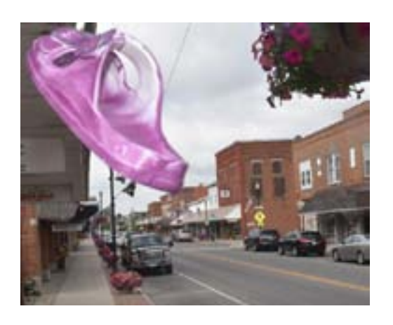
Purple shoes hanging on Main Street

She also said that this year's Relay has lots of entertainment all evening and food and pie and chair auctions, kids games fun for the whole community.