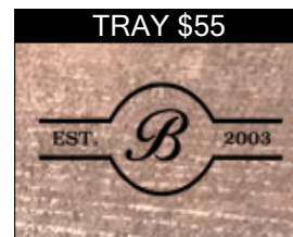
5) Script Tray w/ Initial & Est. date