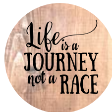
4) Life is a journey round