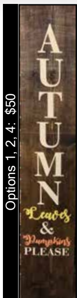
1) Leaves & Pumpkins 10x60

Workshop fee will help raise money for the high school yearbook program.