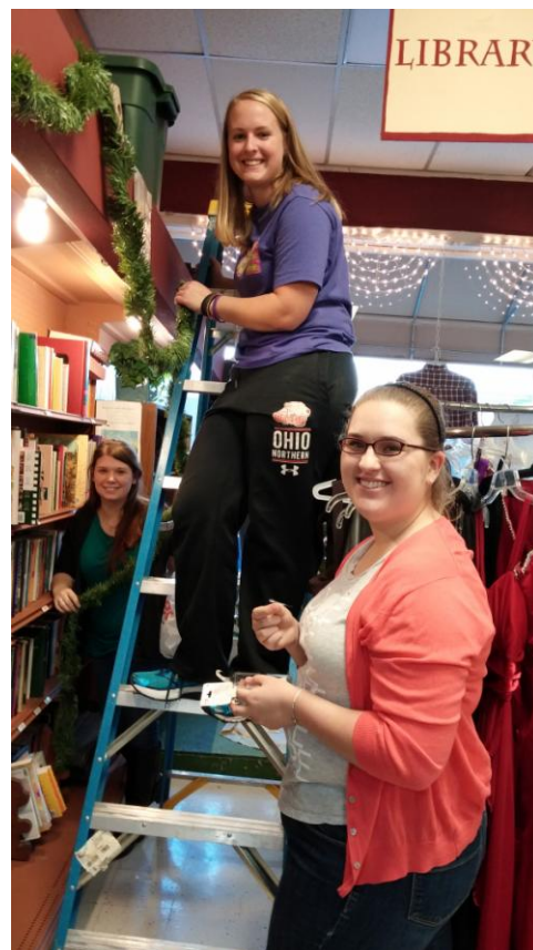
ONU sorority members decorate ReStore

And... Stop by! ReStore's hours are: Mon 12-4 PM | Tues 12-6 PM (community dinner 4-6 PM) | Wed 12-6 PM | Thurs 12-6 PM | Fri 12-4.