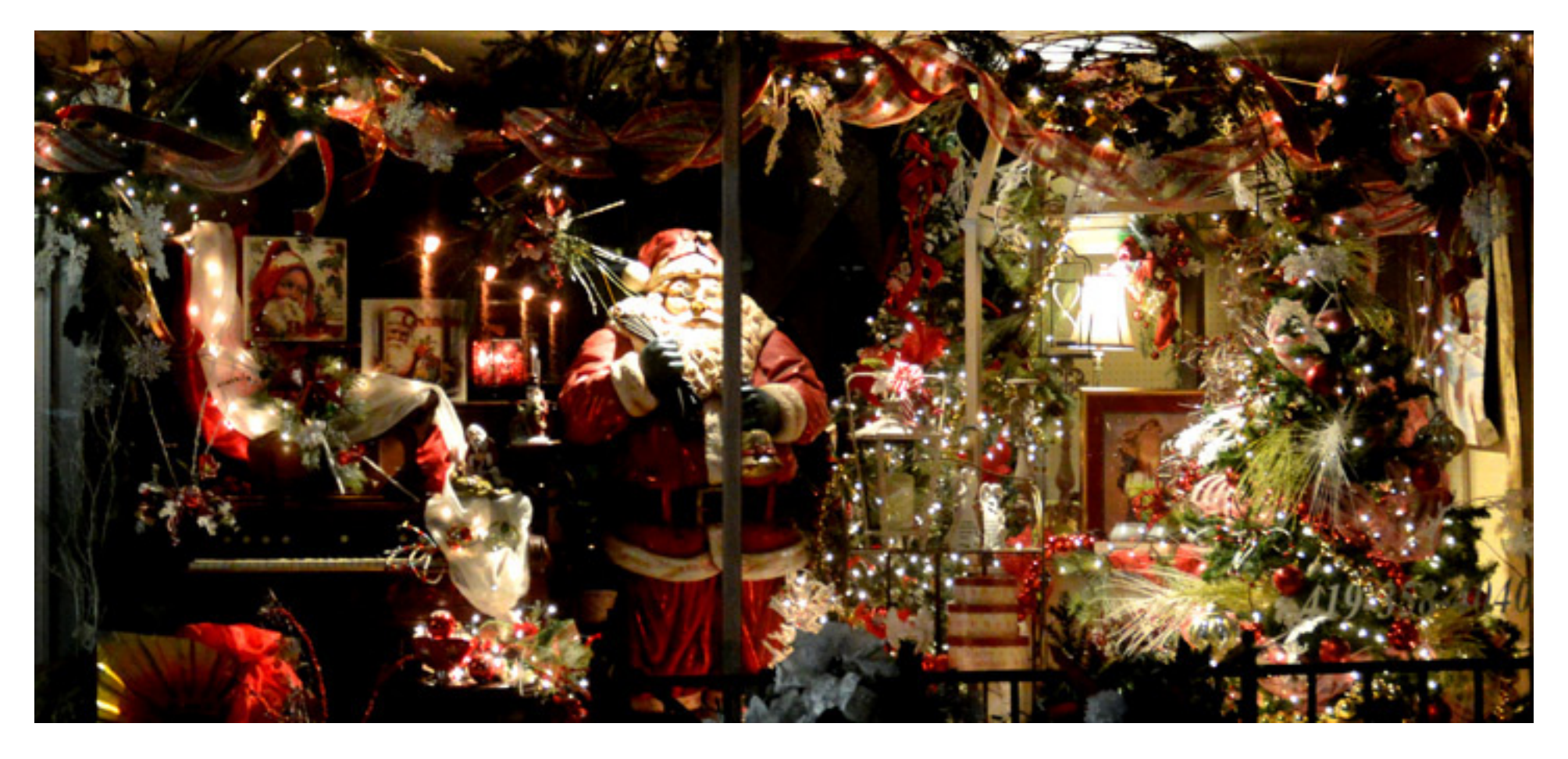
Third place downtown - Town and Country Flowers, 121 S. Main St.