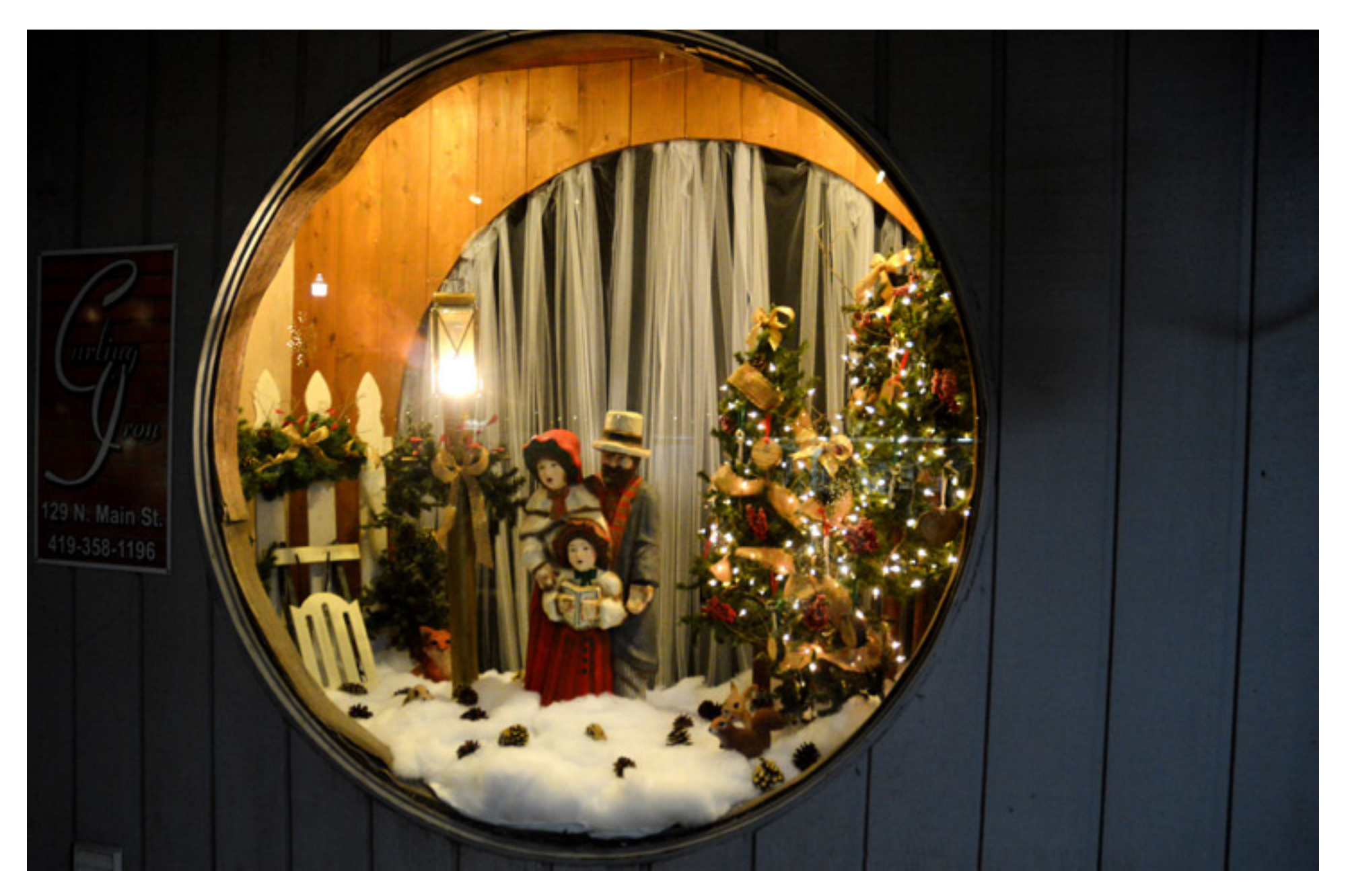
First place downtown - Curling Iron, 129 N. Main St.