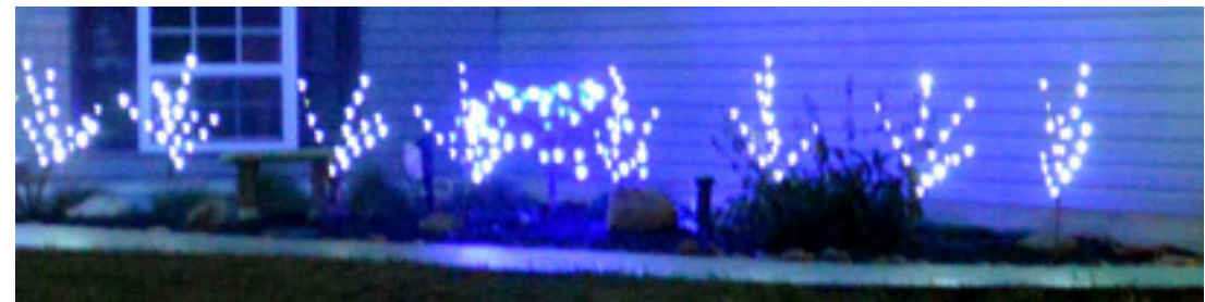
Best "minimal" use of lights Matt and Sherri Oglesbee 313 Jared Circle