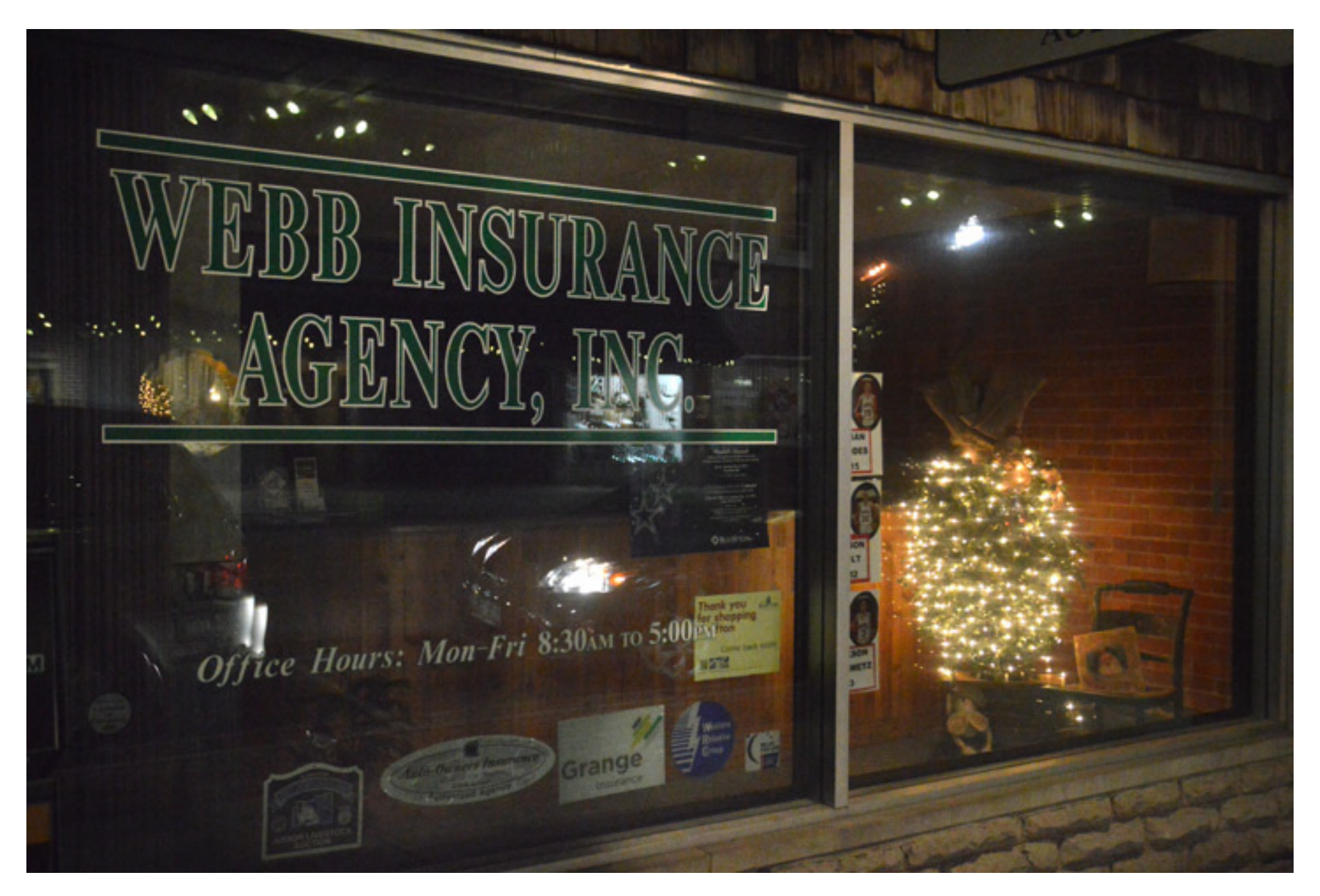
Second place downtown - Webb Insurance, 138 N. Main St.