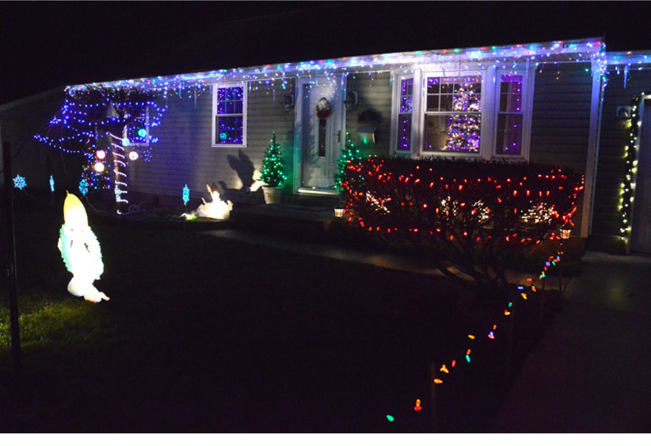
Best "use of lights" - Kathy and Randy Housh, 120 Eastland Drive