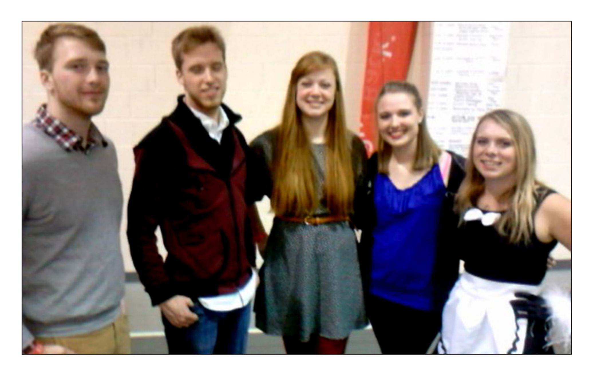
Up for bid.