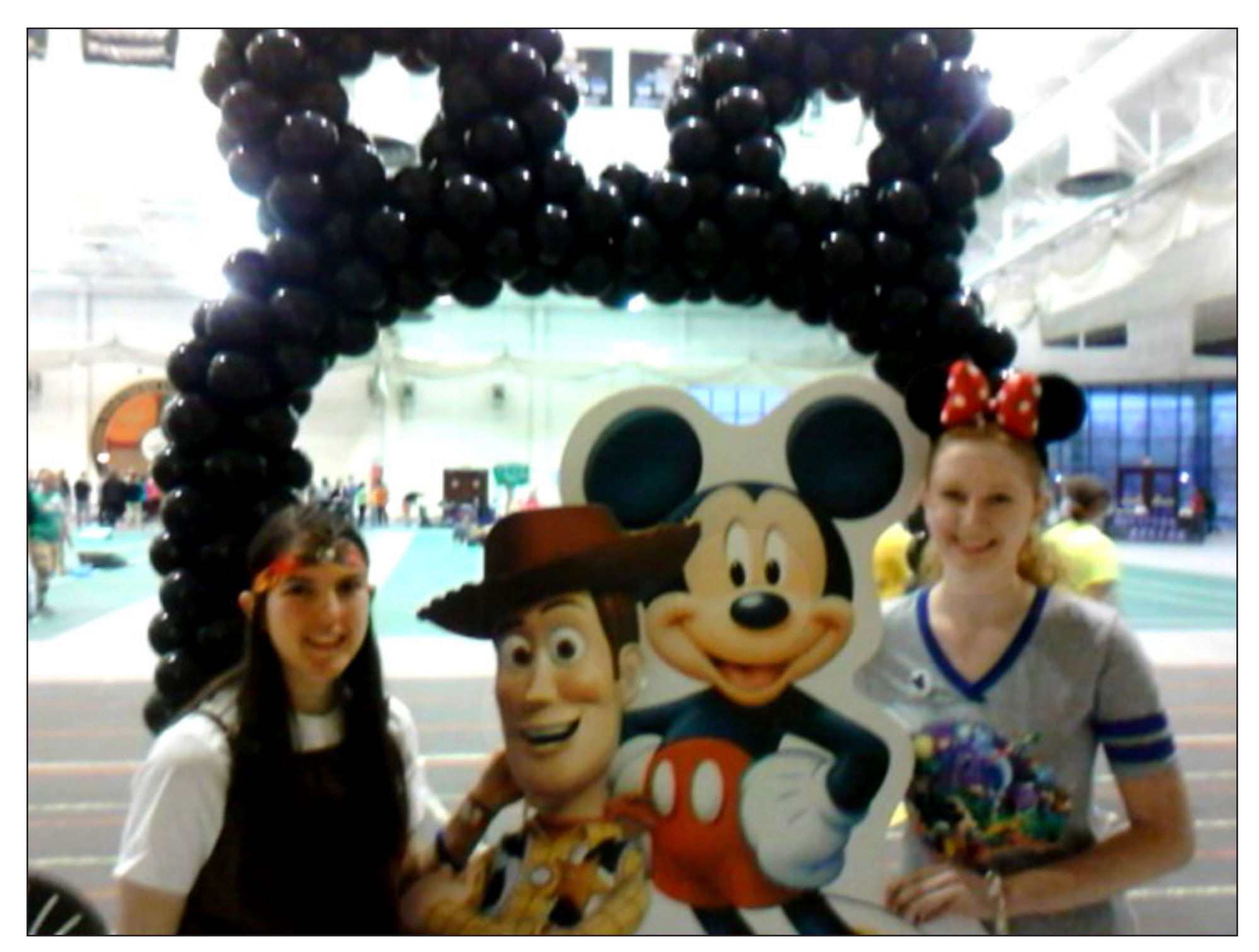
Woody and Mickey