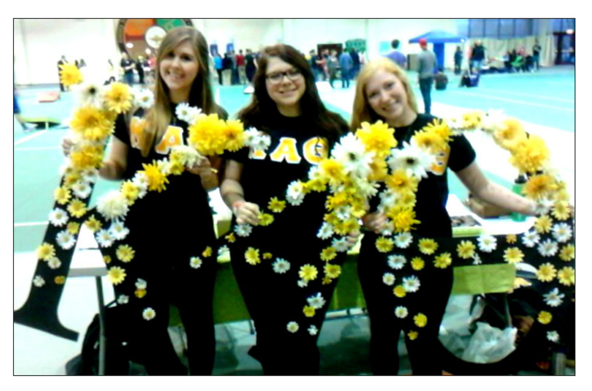
Kappa Alpha Theta