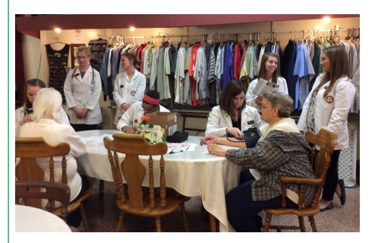
ONU College of Pharmacy staff and students provide health screening at Crockpots