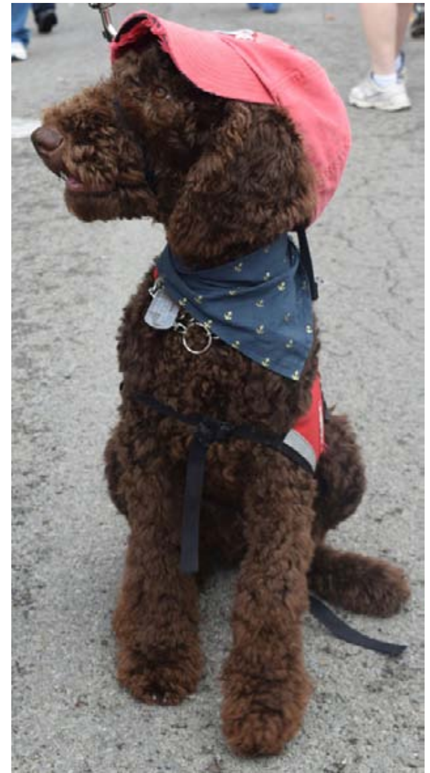
Service Dog Boy Gregory