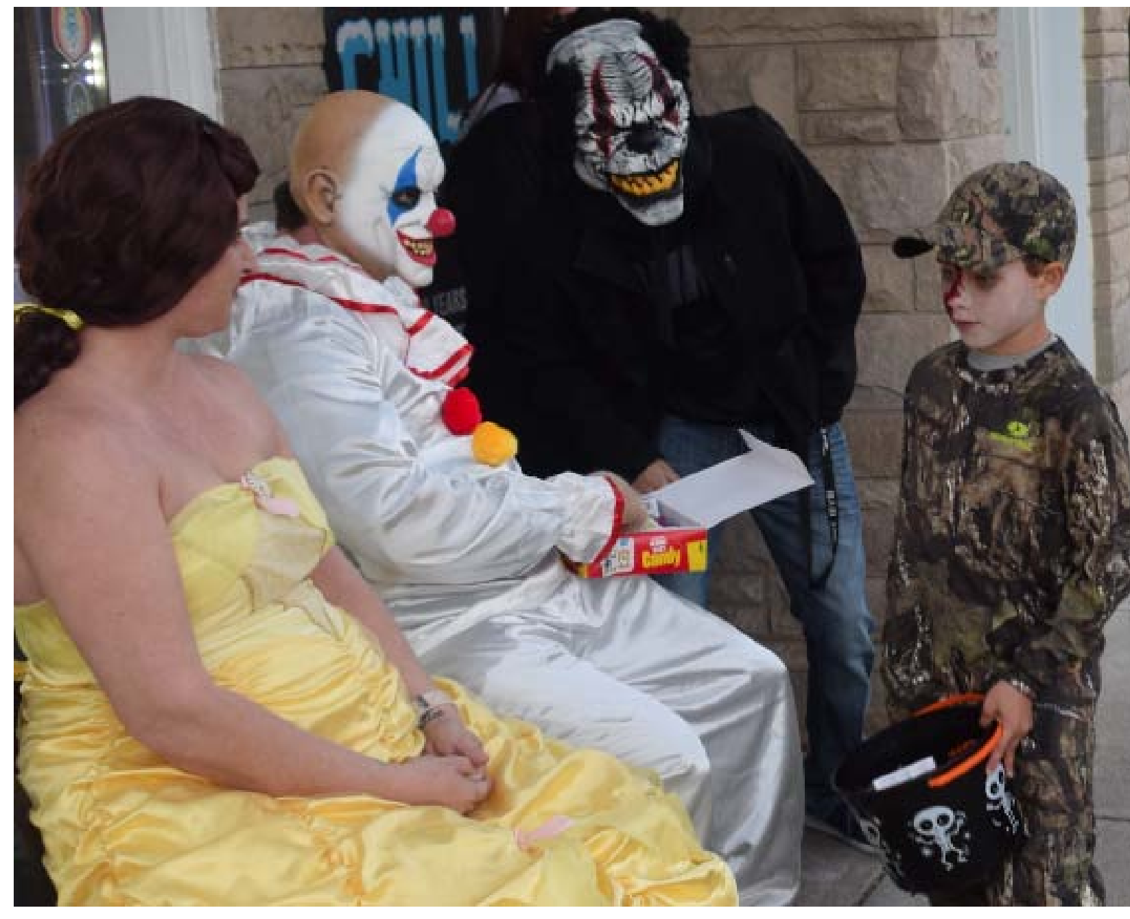
Beauty and The Beast