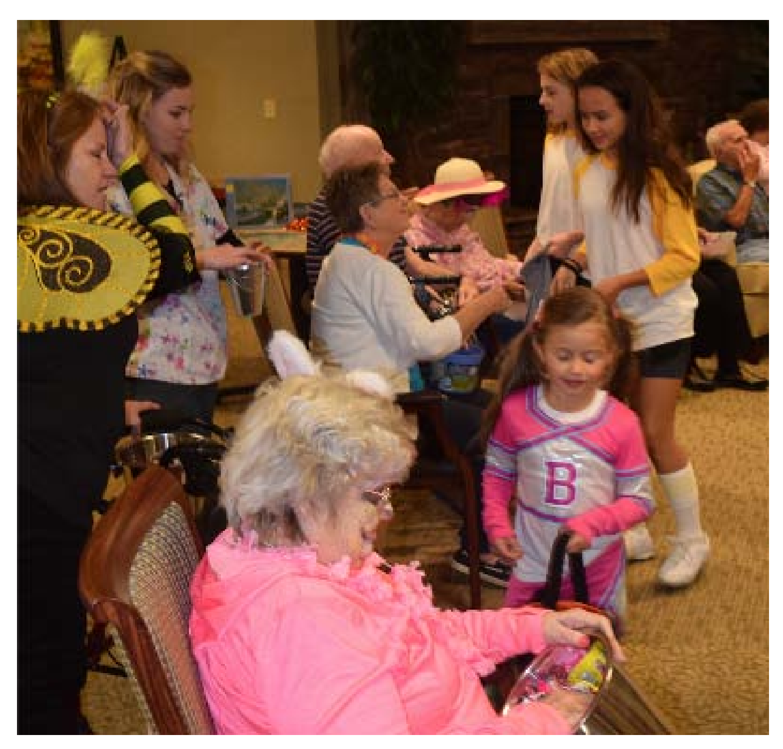
Goodies from Vancrest residents.