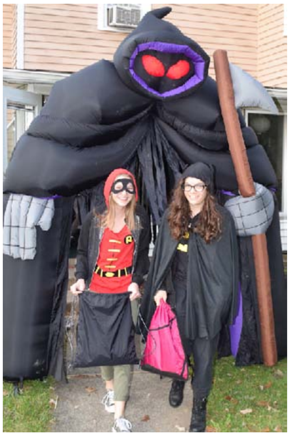
They escaped unharmed.