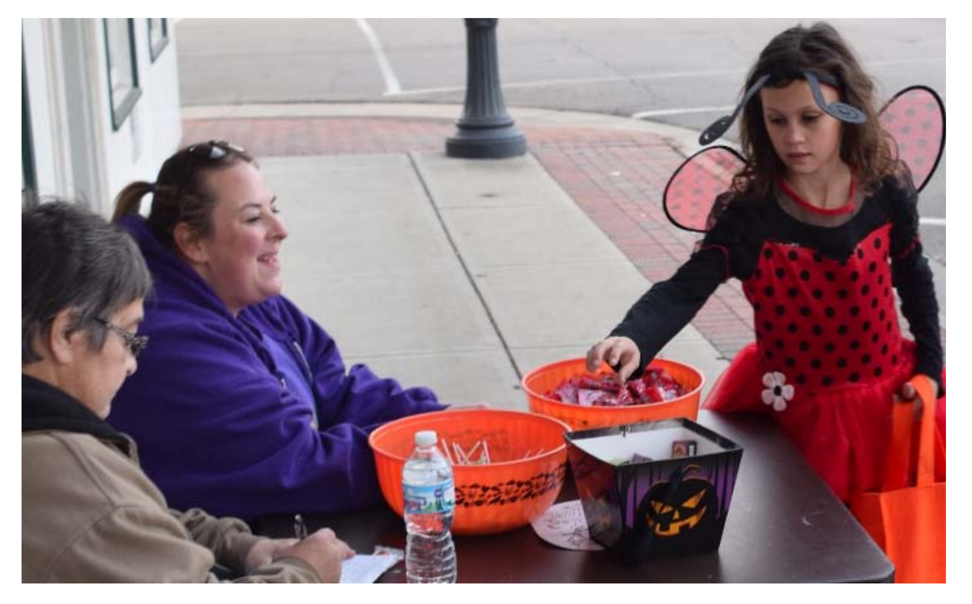
"That one will do nicely, thank you."