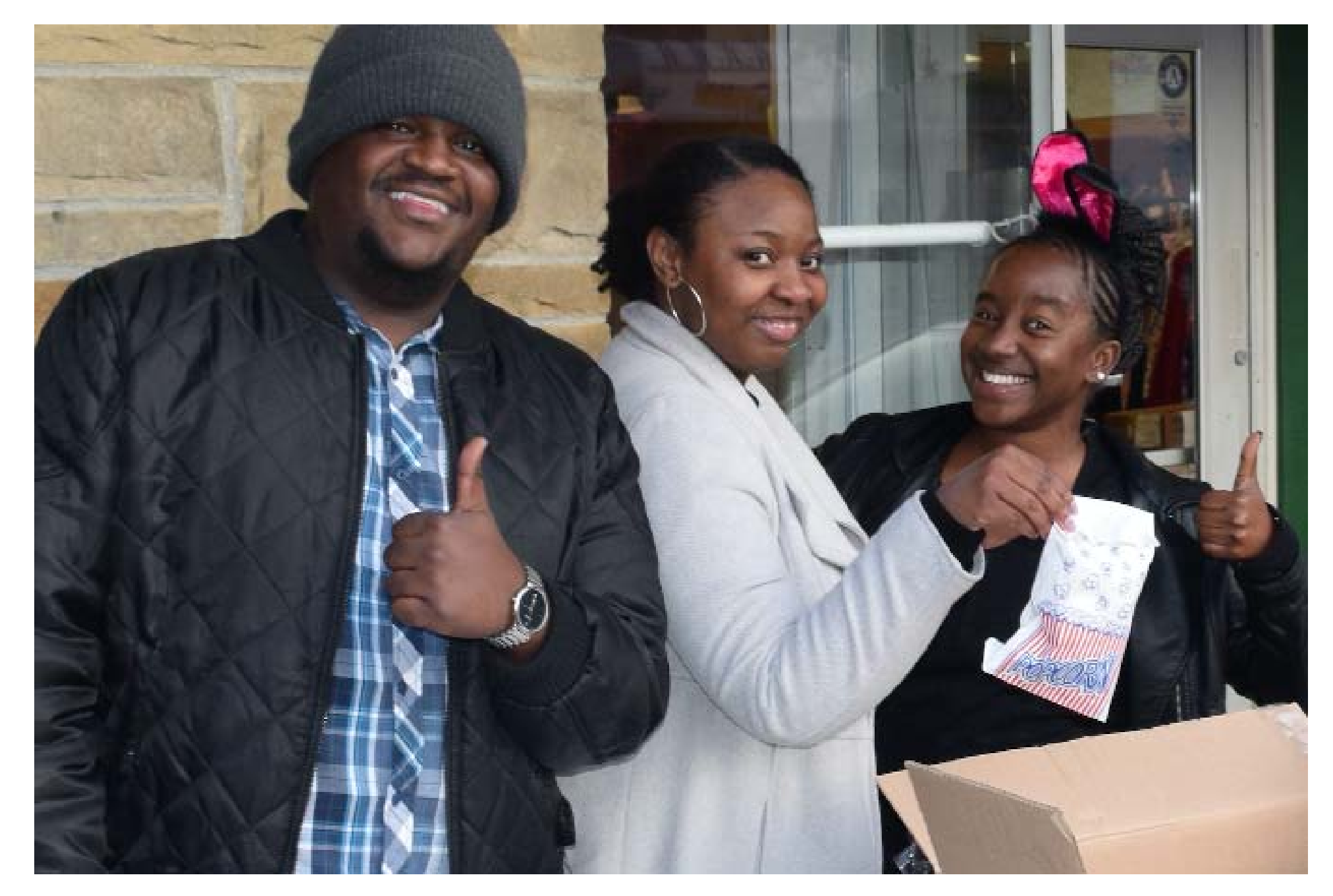
ReStore popcorn passer-outers.