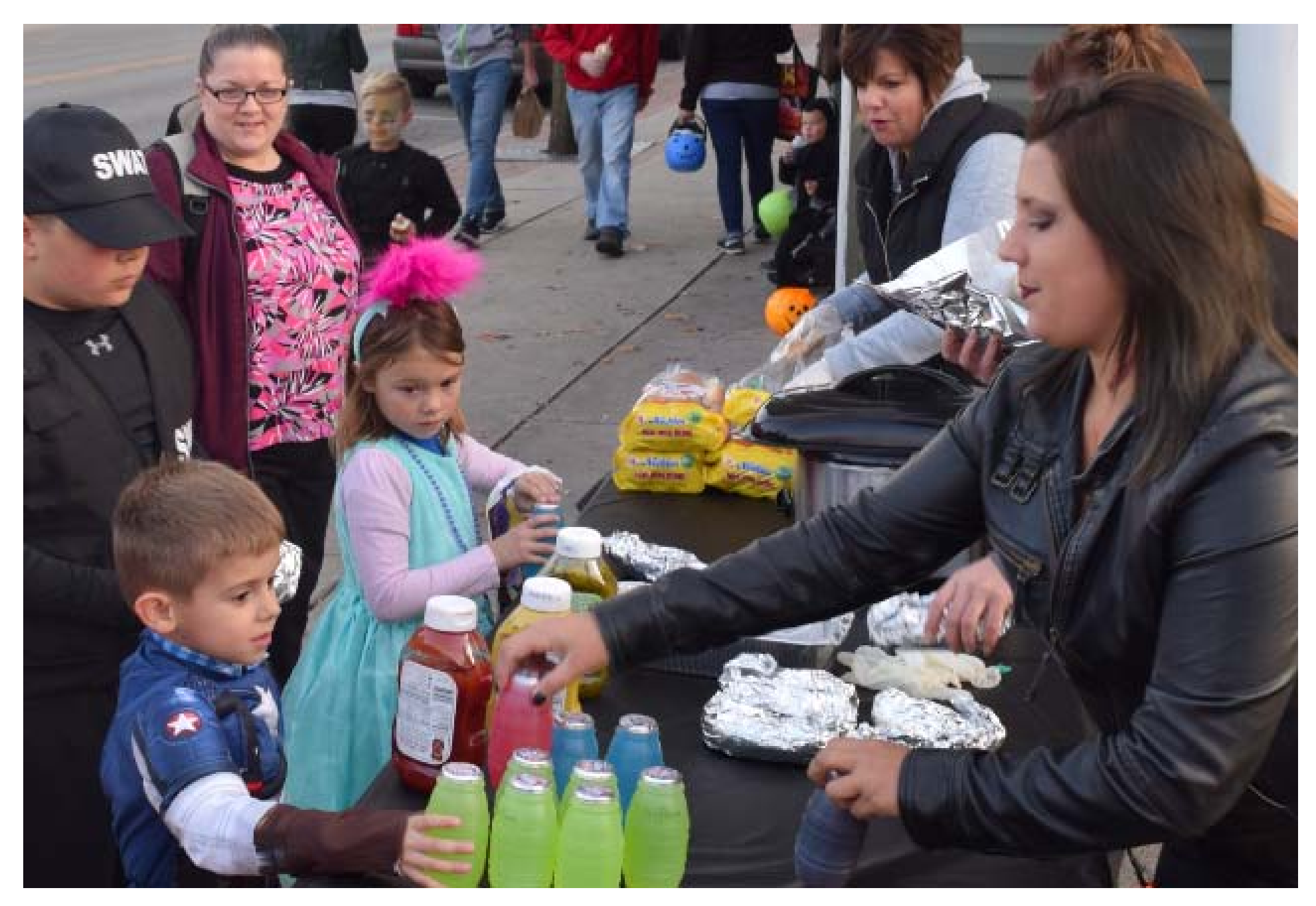
Tavern 101 handing out food, of course.