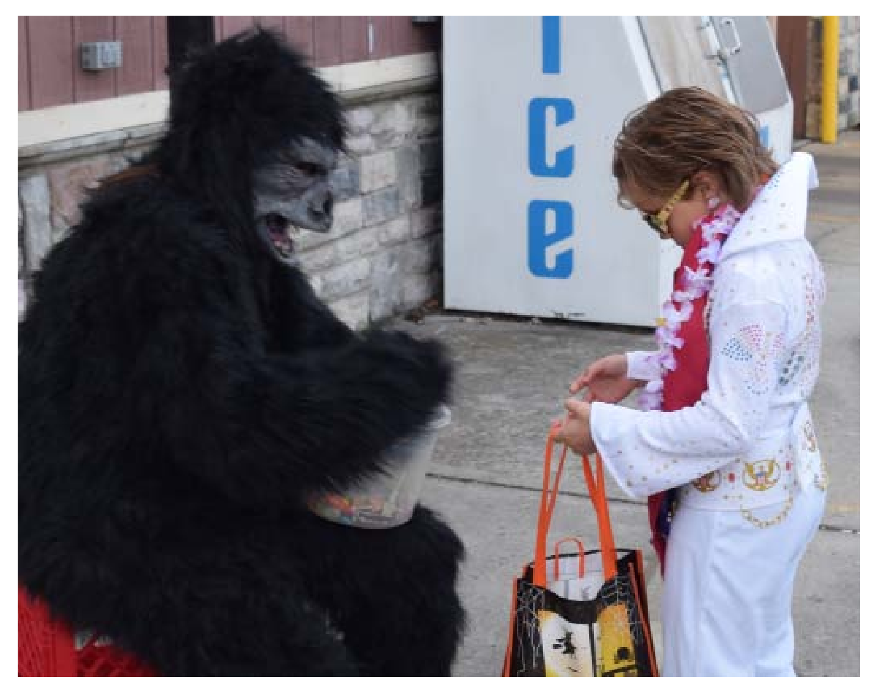
Elvis and the Gorilla.