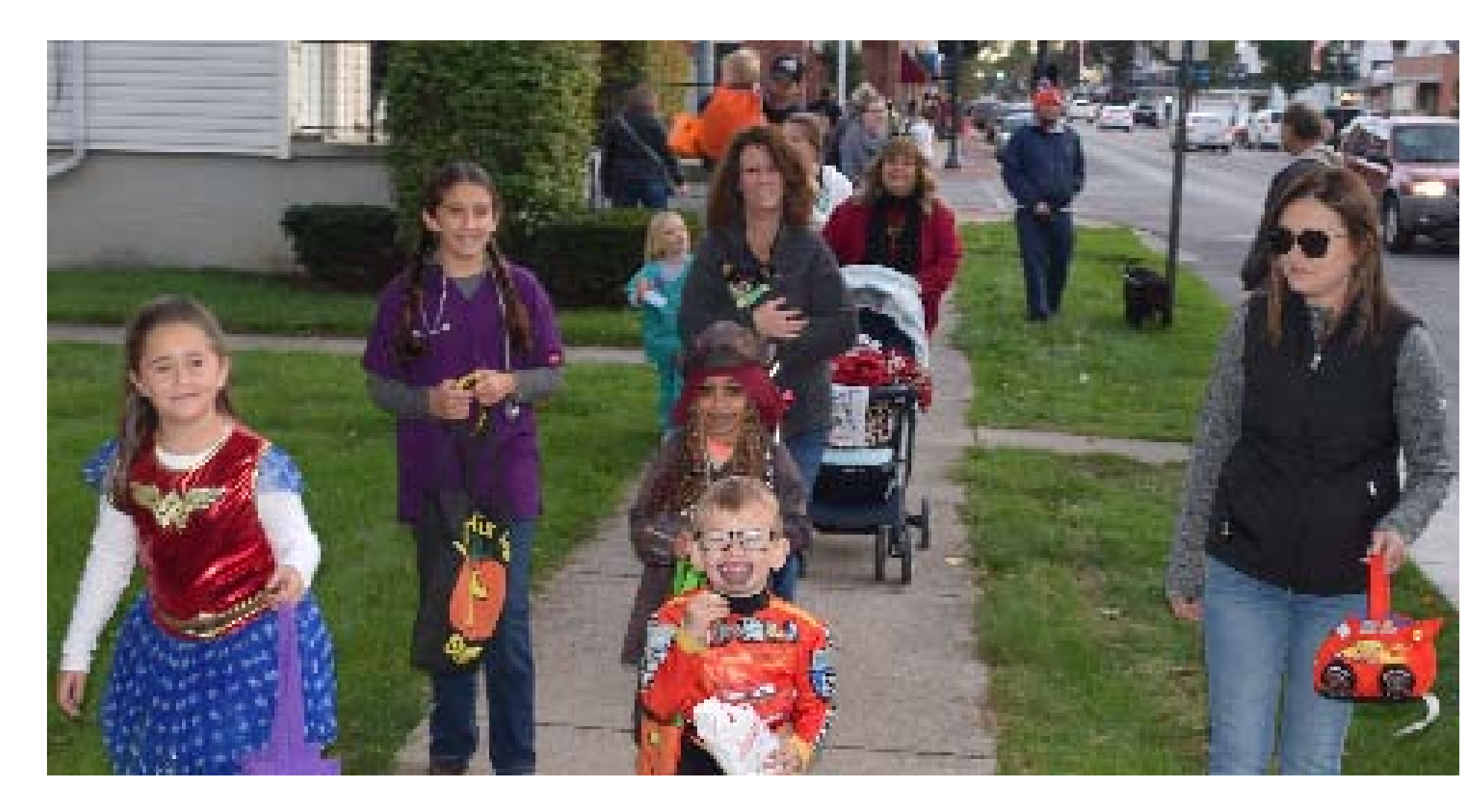
Main Street full, full of happiness.