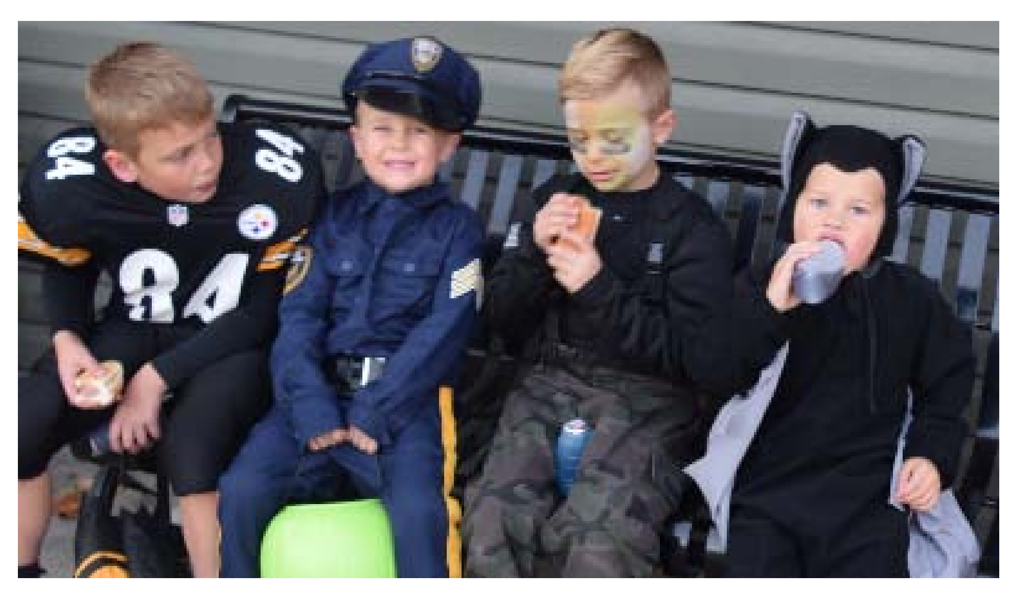
Sometimes a guy's gotta take a rest.