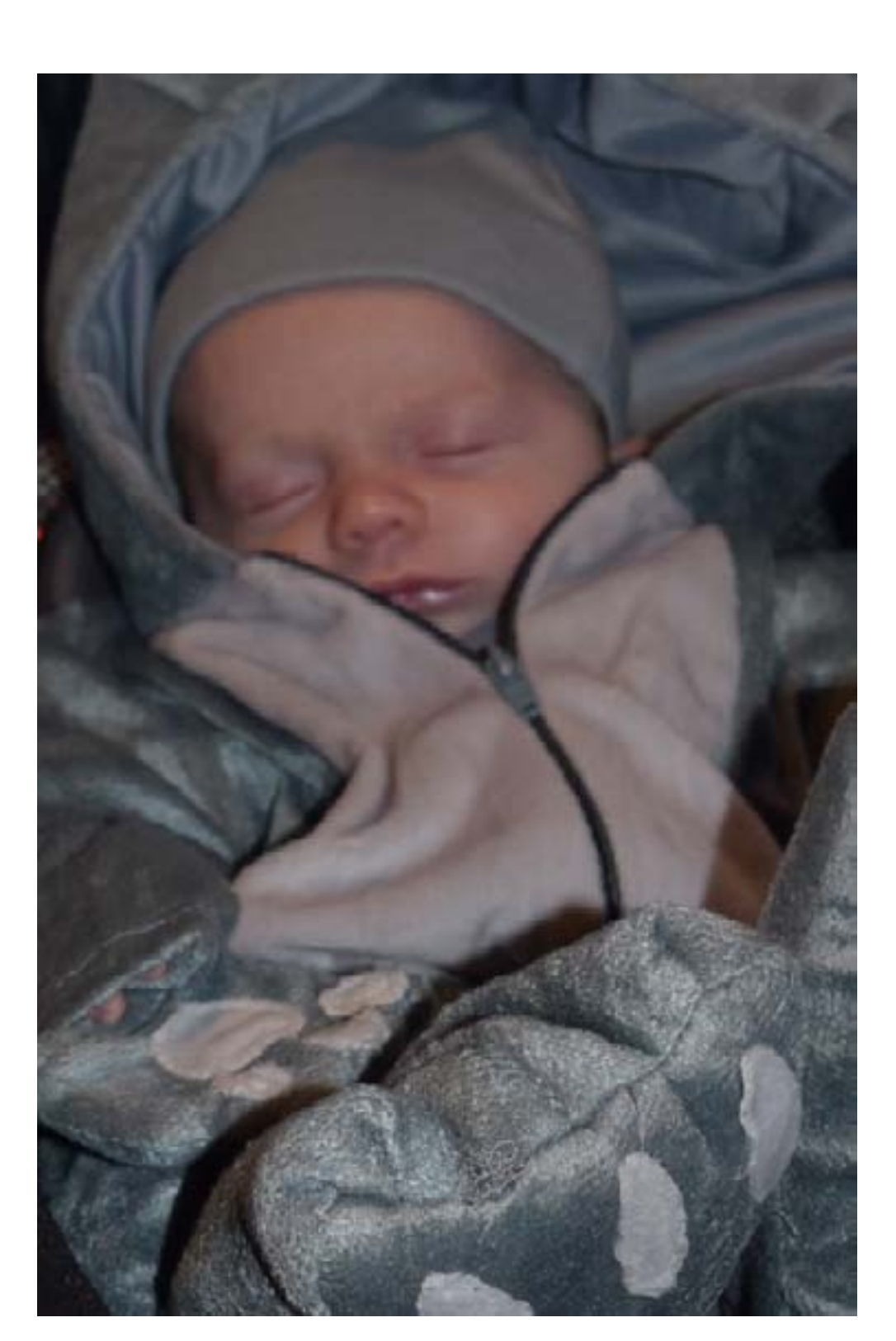
A baby mouse... or maybe a future Mouseketeer