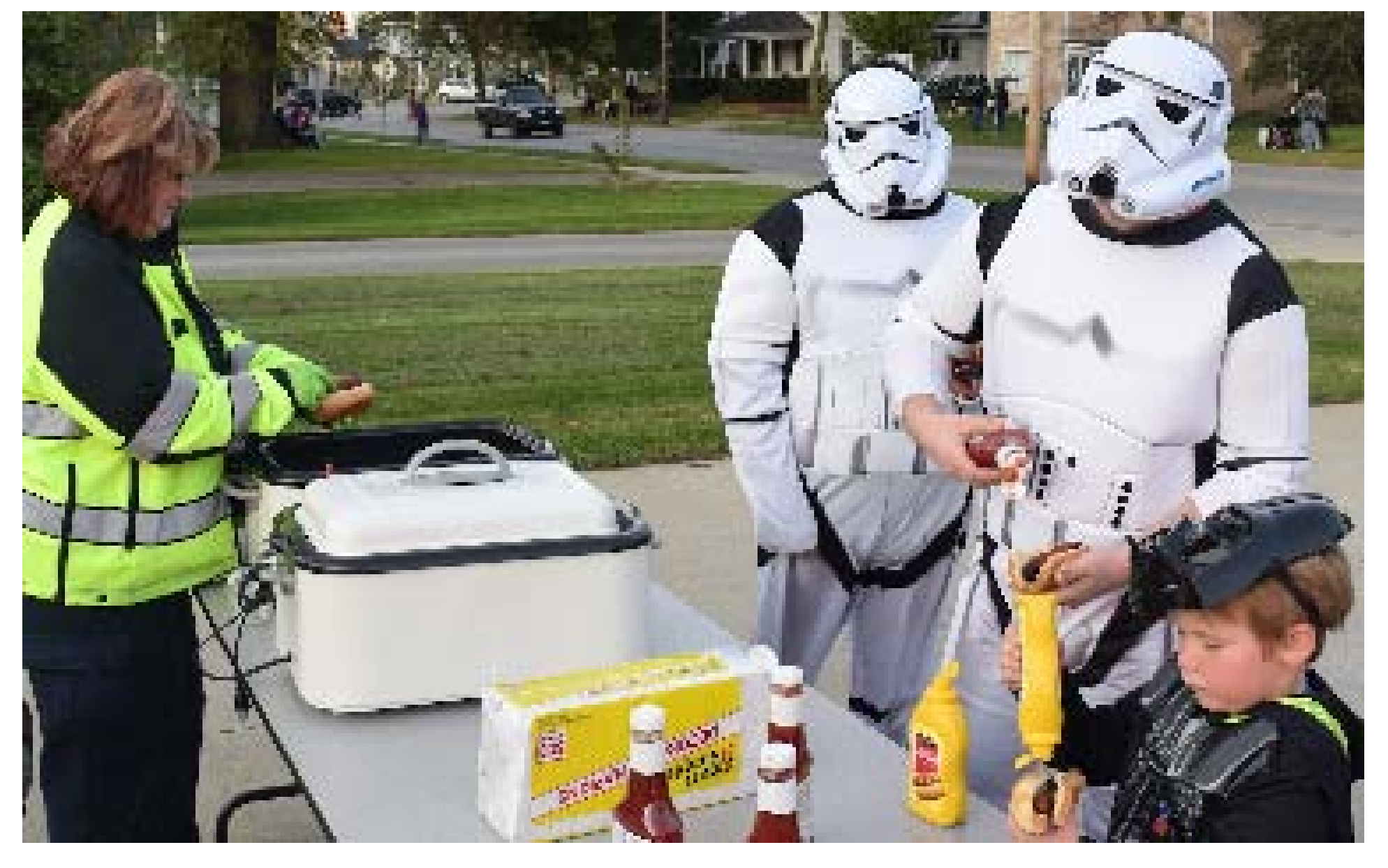
Free hotdogs at the fire station no matter what planet you are from.