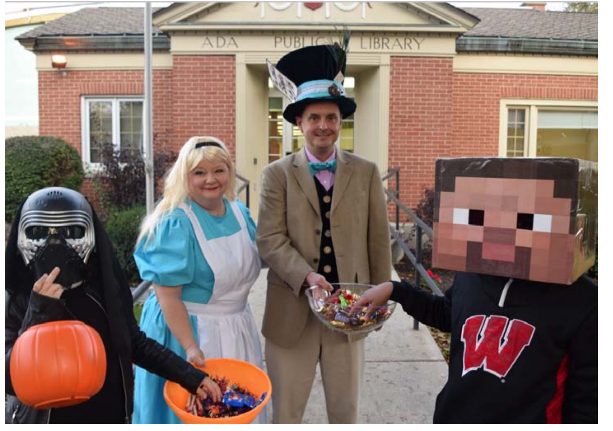
A new kind of library patron.