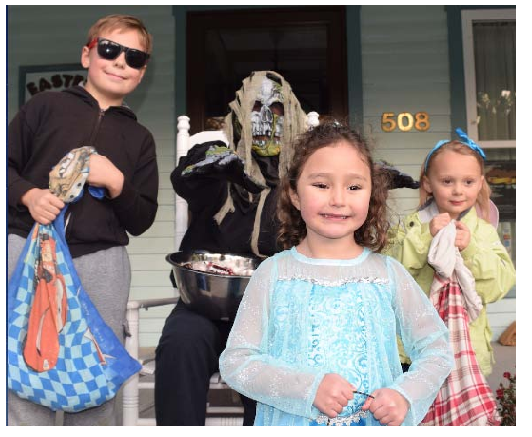
Easter House turned into a spooky house.