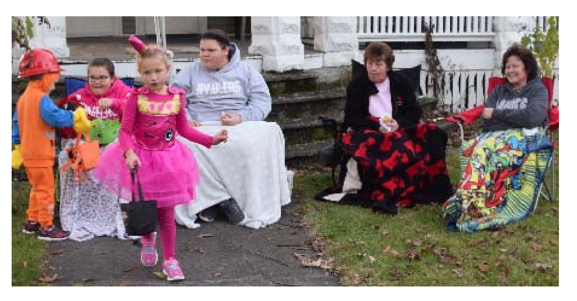
Greeted on the front lawn.