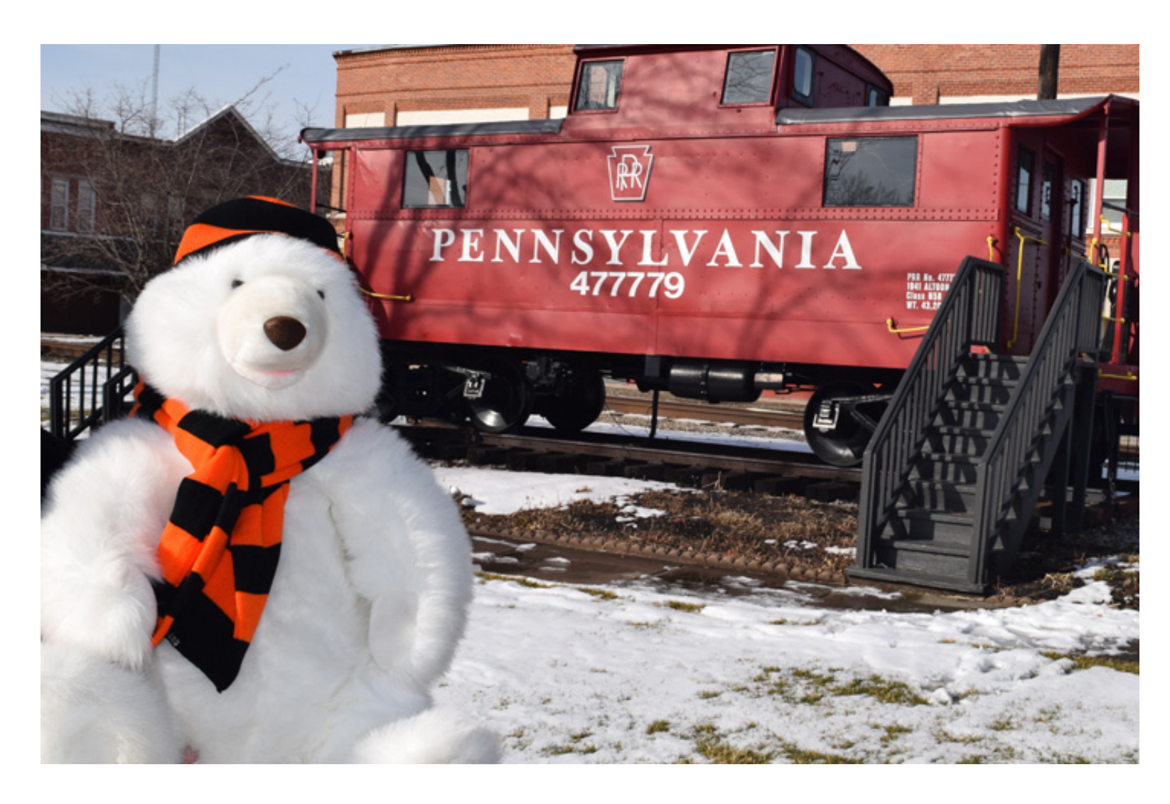
I think I'll take the train home. Does it go North?