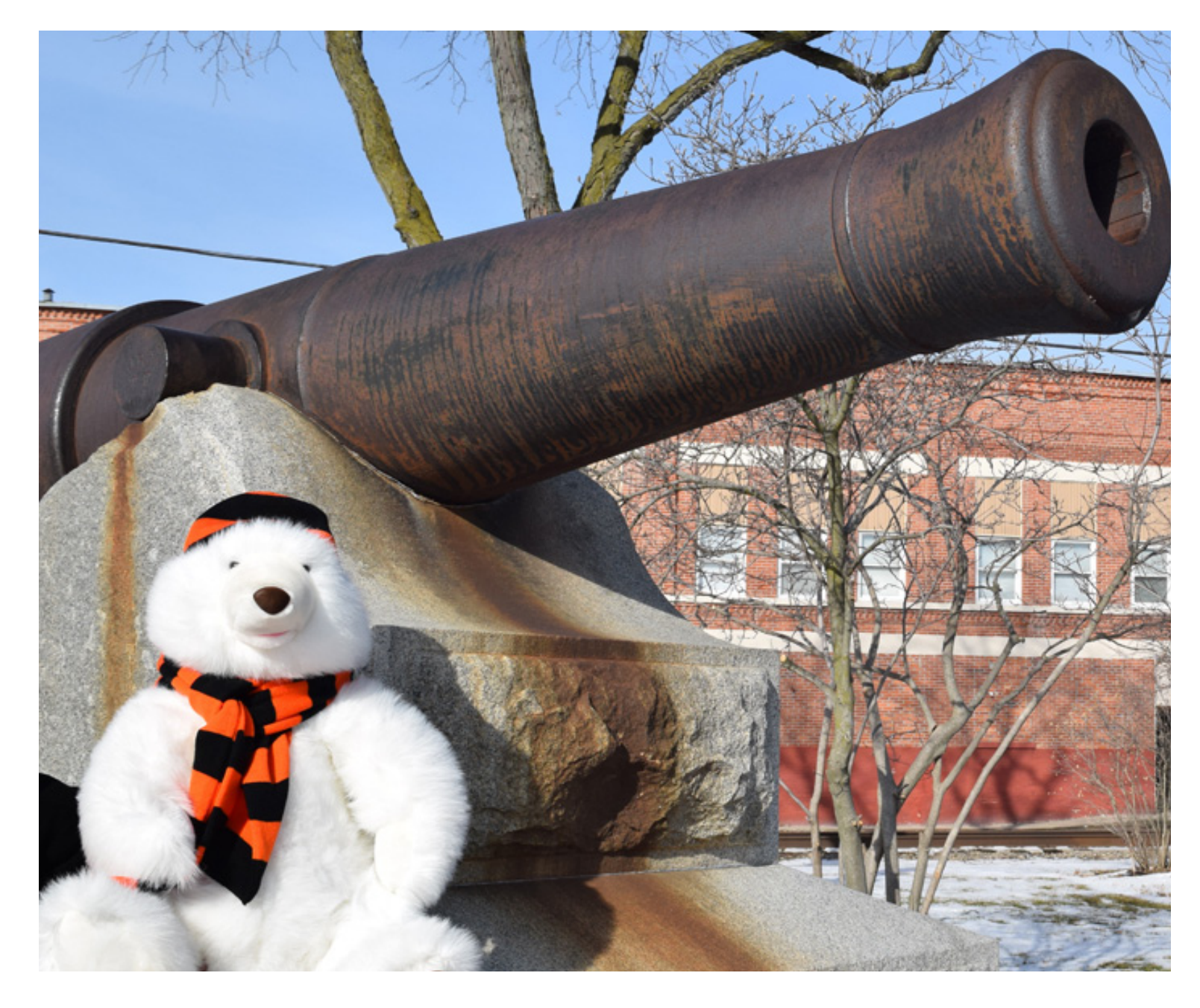
Wow, a cannon. Are these a militaristic people?

Tomorrow—Bi finds there are many polar bear places all over campus, in and outside buildings. The final installment—Polar Bear heaven... King-Horn and the Sports Center, lots of polar bears there.