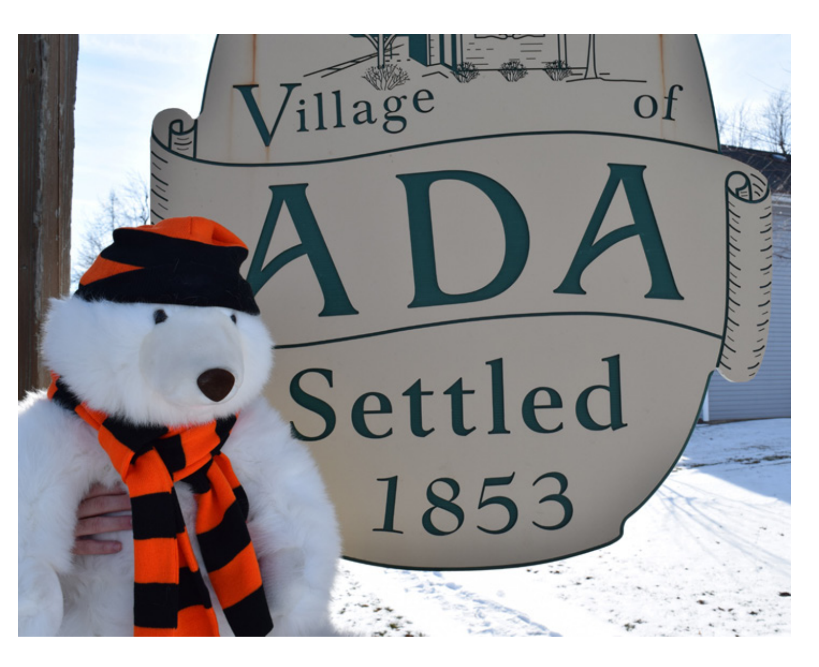
Bi reaches the village limits.