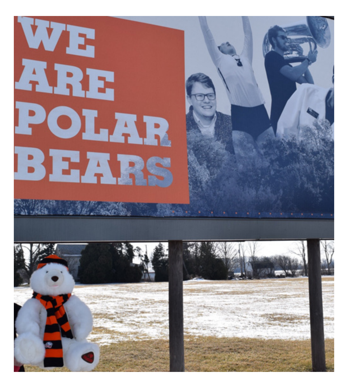
Bi gets a big welcome.