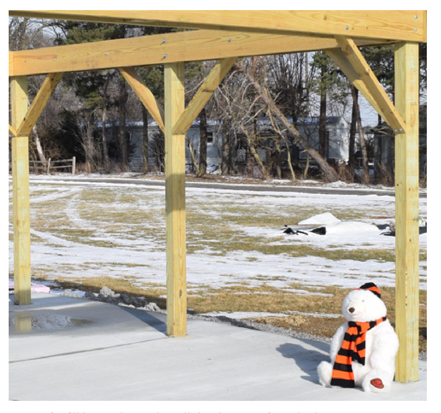
Wow. They'll have a dog park. Will they have one for polar bears, too?